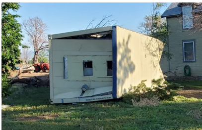
Protection from windstorms and acts of God

*$1,000 deductible and $50,000 max coverage for Tank & Pump equipment