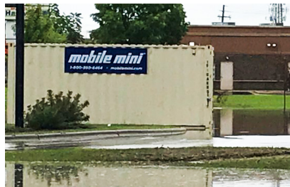
Protection from floods and hurricane damage

EXCLUSIONS: Damages caused by negligence, abuse, wear & tear, or customer modifications. Loss or damage of Lessee property. Damage during transport by Lessee or anyone other than Mobile Mini. Third-party rental services or equipment (e.g. dumpsters, fencing, jiffy-johns, etc.) Other restrictions and apply -- view the Addendum and Summary of Coverage documents at MobileMini.com/customer-care/customer-forms.com .